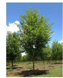
PATMORE ELM -VASE FORM PLANTED SIZE: 70mm CAL.

- BROOKFIELD RESIDENTIAL RESERVES THE RIGHT TO ADJUST ALL PROPOSED TREE PLANTING LOCATIONS TO MEET ALL SETBACK REQUIREMENTS FROM HARD-SURFACES AND UNDERGROUND UTILITY LINES. - ALL FRONT BOULEVARDS THAT MEET THE MINIMUM GROWING AREA REQUIREMENT SET OUT BY THE CITY OF AIRDRIE SHALL HAVE A PUBLIC LINE ASSIGNMENT TREE IN LIEU OF PRIVATE LOT PLANTING TREE. - DURING THE DEVELOPER MAINTENANCE PERIOD (APPROXIMATELY 12-24 MONTHS FROM TIME OF PLANTING), THE HOMEOWNER HAS NO OBLIGATIONS TO CARE FOR THE TREE. FOLLOWING THE DEVELOPER MAINTENANCE PERIOD, TREES BECOME CITY PROPERTY AND THE CITY SHALL ASSUME FULL RESPONSIBILITY FOR THE MAINTENANCE & CARE OF THE TREE. ALL LINE ASSIGNMENT / BOULEVARD TREES ARE PROPERTY OF THE DEVELOPER OR CITY AND CAN NOT BE REMOVED OR ALTERED.