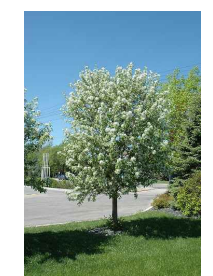
STARLITE FLOWERING CRAB -UPRIGHT, COLUMNAR FORM -PINK FLOWERS -PLANTED SIZE: 70mm CAL.