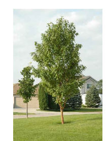
GOLDRUSH AMUR CHERRY -OVAL FORM -PLANTED SIZE: 70mm CAL.