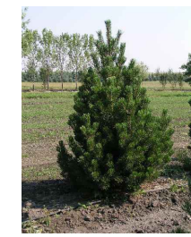
CORNER LOT MOUNTAIN PINE PLANTED SIZE: 2.5m HT.