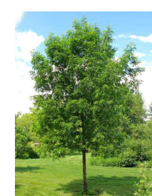
PRAIRIE SPIRE GREEN ASH -OVAL FORM -PLANTED SIZE: 70mm CAL.