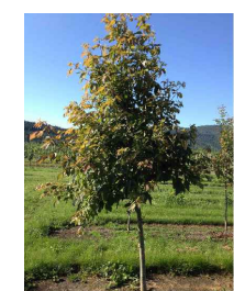
PATMORE ELM -VASE FORM PLANTED SIZE: 70mm CAL.