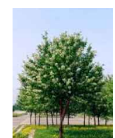
KLONDIKE AMUR CHERRY -UPRIGHT FORM -PLANTED SIZE: 75mm CAL.