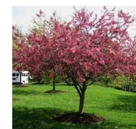
KELSEY FLOWERING CRAB -UPRIGHT FORM -PLANTED SIZE: 75mm CAL.