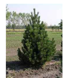
CORNER LOT MOUNTAIN PINE PLANTED SIZE: 2.5m HT.