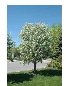
STARLITE FLOWERING CRAB -UPRIGHT, COLUMNAR FORM -PINK FLOWERS -PLANTED SIZE: 70mm CAL.