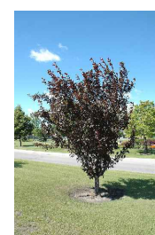
THUNDERCHILD FLOWERING CRAB -UPRIGHT FORM -PURPLE FOLIAGE -PLANTED SIZE: 75mm CAL.