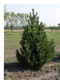
CORNER LOT MOUNTAIN PINE -ORNAMENTAL UPRIGHT -WINTER EVERGREEN -PLANTED SIZE: 2.5m HT.