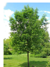
PRAIRIE SPIRE GREEN ASH -OVAL FORM -AUTUM GOLD COLOUR -PLANTED SIZE: 70mm CAL.