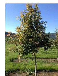
PATMORE ELM -VASE FORM -HIGH OVERHEAD CANOPY -PLANTED SIZE: 70mm CAL.