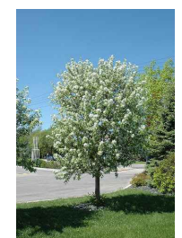
STARLITE FLOWERING CRAB -UPRIGHT FORM -WHITE FLOWERS -PLANTED SIZE: 70mm CAL.