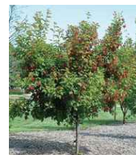
RUBY SLIPPERS AMUR MAPLE -OVAL FORM -RED/ORANGE ACCENTS -PLANTED SIZE: 50mm CAL.