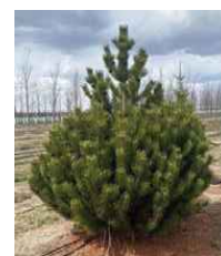
CORNER LOT MOUNTAIN PINE -ORNAMENTAL UPRIGHT -WINTER EVERGREEN -PLANTED SIZE: 2.5m HT.