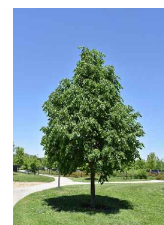
GREENSPIRE LINDEN -PYRAMIDAL FORM -GOLD FOLIAGE IN FALL -PLANTED SIZE: 70mm CAL.