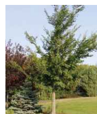
NIGHT RIDER ELM -UPRIGHT, ROUNDED -ORANGE-BURGUNDY IN FALL -PLANTED SIZE: 70mm CAL.