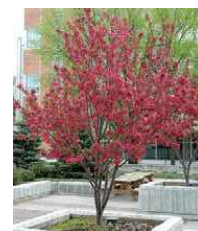
RADIANT FLOWERING CRAB -ROUNDED FORM -RED FOLIAGE, PINK BLOOMS -PLANTED SIZE: 75mm CAL.