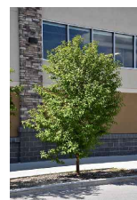
KLONDIKE AMUR CHERRY -UPRIGHT FORM -WHITE FLOWERS -PLANTED SIZE: 70mm CAL.